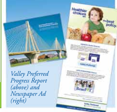
Valley Preferred Progress Report (above) and Newspaper Ad (right)

The Gold Award went to Valley Preferred in the Radio—Single Spot category for its 60-second commercial titled "Healthier Choices—Best Policy." A Bronze Award was also won by Valley Preferred in the Newspaper—Single Ad category along with two Merit Awards in the Annual Report and Outdoor categories. A national panel of judges were engaged in reviewing all entries based on creativity, quality, message effectiveness, consumer appeal, graphic design and overall impact. Healthcare Marketing Report is a leading national publication covering all aspects of health care marketing, advertising and strategic business development. For facts, visit hmrpublicationsgroup.com .