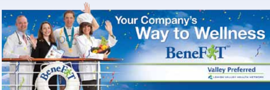
New Valley Preferred Billboard Campaign

NOW AVAILABLE to ALL companies in Eastern PA regardless of health plan